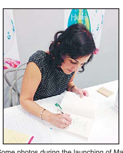
Some photos during the launching of Mai Al-Nakib's 'The Hidden Light of Objects.'

The Hidden Light of Objects is a collection of loosely connected short stories set mainly in the Middle East. They trace quiet, ignored moments in a region overwhelmed by geopolitical, military, and religious forces. Although the stories engage familiar